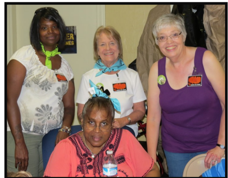
Our Crafty Craft Crew