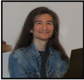
Our Magnificent Musician