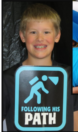
Tons of Fun in the Sun

Each day we averaged 50 children. It was awesome!