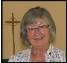
Our Excellent Bible Challenge Expert