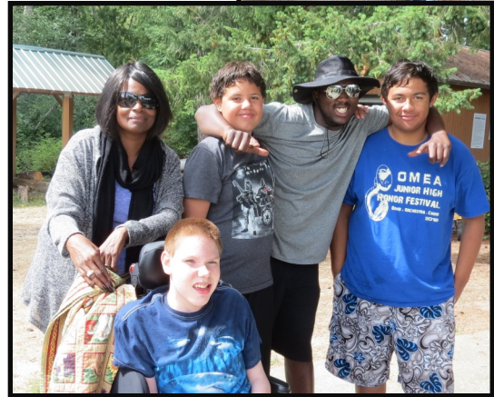
Godmother with her Godsons !