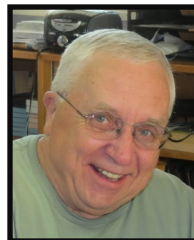
Our Mighty Media Man