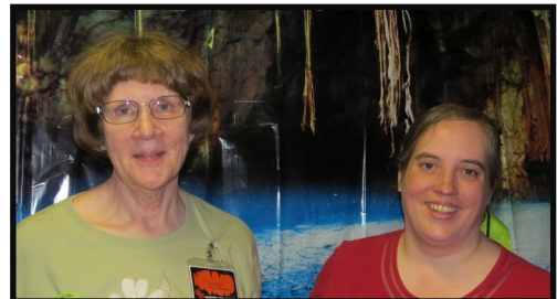
Our Superb Bible Storytellers