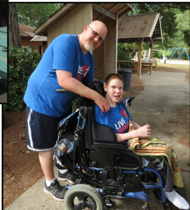
A Day Enjoyed by All Ages