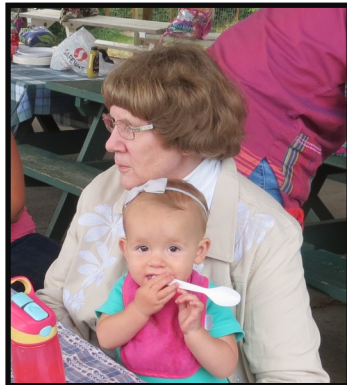
Emmanuel Lutheran's Annual Picnic 2016