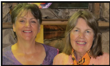
The Super Snack Ladies