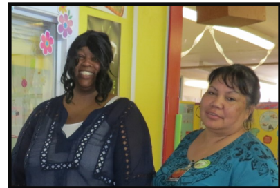
Our Terrific Childcare Coordinators and Pre-School Staff