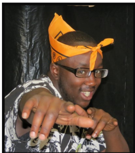
Our Tenacious Team Leaders