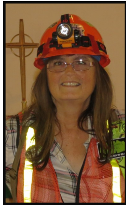
Our Fearless Leader