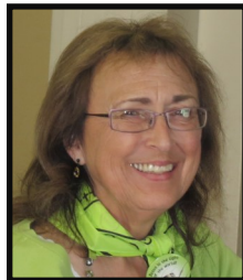
Our Always Willing Registrar & Craft Helper