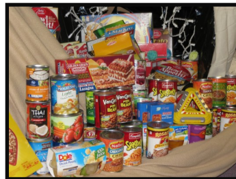
The children donated 124 lbs of food and money each day to help our local food bank.