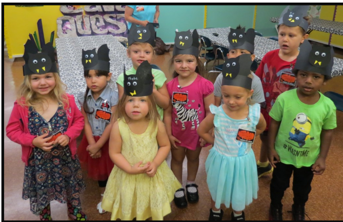
Our Pre-Schooler's wearing their "Bat Hats"