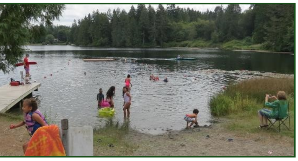
The Children enjoyed the lake.