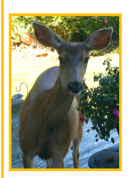
She is attempting to have a snack. Miki came over to the window so she left the deck.

This doe is making sure that Miki is not in a position to chase her off.