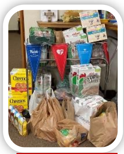
The little church that gives big!!!

Our Food Bank Mission is not only important, it's vital! There are so many people whose lives are impacted by the lack of food. As evidenced by the little girl who admitted in her virtual classroom that she was starving. Her mother had lost her job due to Another young man, age 14, said "It wasn't his day to eat, it was his brother's turn." A family of six moved into their car after losing their home, a teenager said his family stocked up on rice so they would have something to eat. Covid has "killed" so many jobs, especially for low wage workers, women and minorities. Many of those jobs will never make a full recovery. Nine million plus jobs have been lost due to Covid, Four and a half million people who have lost their jobs do not have enough to eat. Of those low wage jobs that will recover, the recovery will be a long-time coming. Meanwhile, those workers without hope and without resources will have to depend on the human