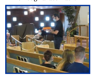
The Children's Sermon was delivered a bit different.

All Congregants are required to wear a mask. The entire service was done via a Power Point thanks to Glen.