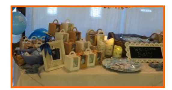
Everyone received goodies that were carefully prepackaged to keep them hands free.