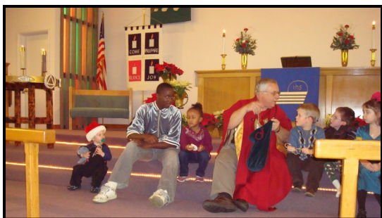
Saint Nicholas explains the true story of Christmas to a very interested crowd !